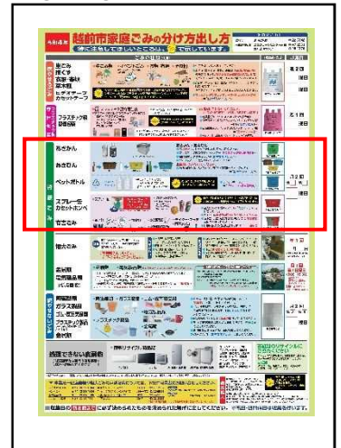
<<garbage separation poster>>