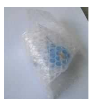
Plastic cushioning material to wrap fragile items