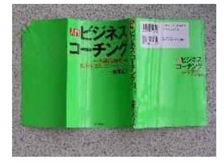
Paper with a thin plastic coating,