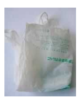
Plastic bags (Plastic shopping bags, etc.)