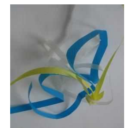
PP-Bando Plastic string for packing Please cut within 1m.